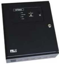
GFM 600 Ground Fault Monitor

Raptor integration and custom solutions include a comprehensive facility management system, services to design custom equipment, and standard products and sensors. Raptor products easily integrate into existing management and monitoring systems to provide enhanced visibility of critical equipment and environmental conditions.