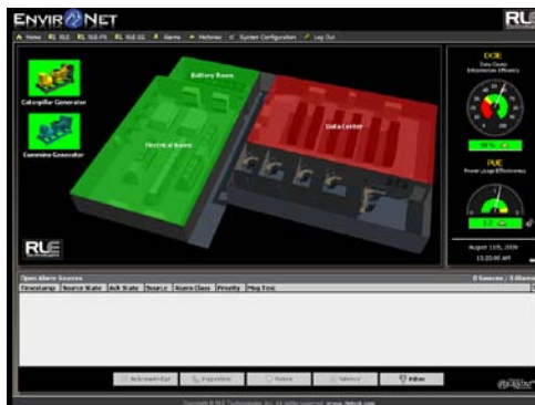
Environet Monitoring and Control System