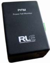
Power Fail Monitor