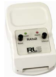
RA1x2 Alarm, Signal Splitter & Relay Replicator